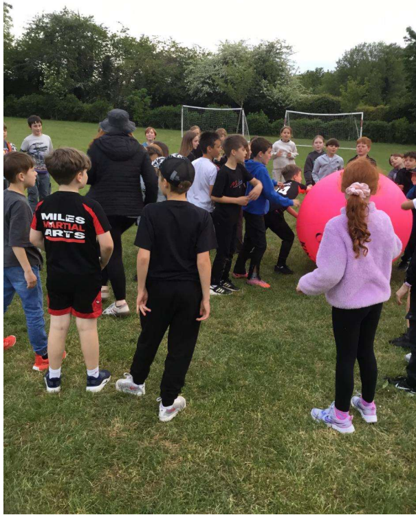
Year R Godstone Farm