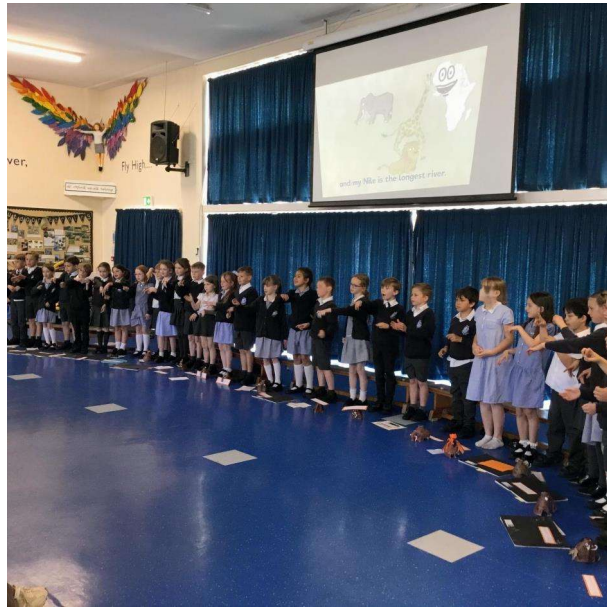
Year 2 Class Assembly- well done Pandas class you were all incredible!